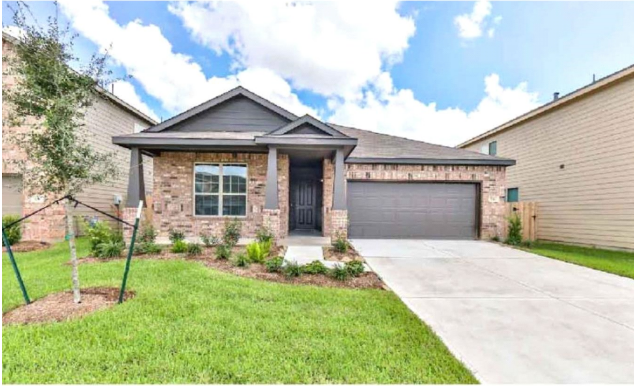
REPRESENTATIVE IMAGE *